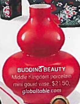
BUDDING BEAUTY Middle Kingdom porcelain mini gourd vase, $21.50; globaltable.com