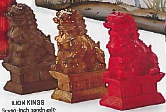
LION KINGS Seven-inch handmade chocolate Foo dogs, $45 each; woodhousechocolate.com

THE BRIGHT STUFF Safavieh Meander table lamp, $420 for two; jcpennyc.com