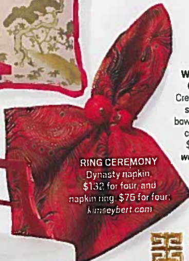
RING CEREMONY Dynasty napkin, $132 for four, and napkin ring, $75 for four; kimseybert.com