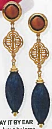
PLAY IT BY EAR Ben-Amun by Isaac Manevitz Silk Road drop earrings, $195; ben-amun.com