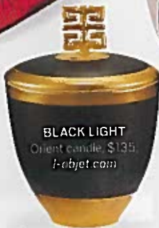
BLACK LIGHT Orient candle, $135; i-objet.com