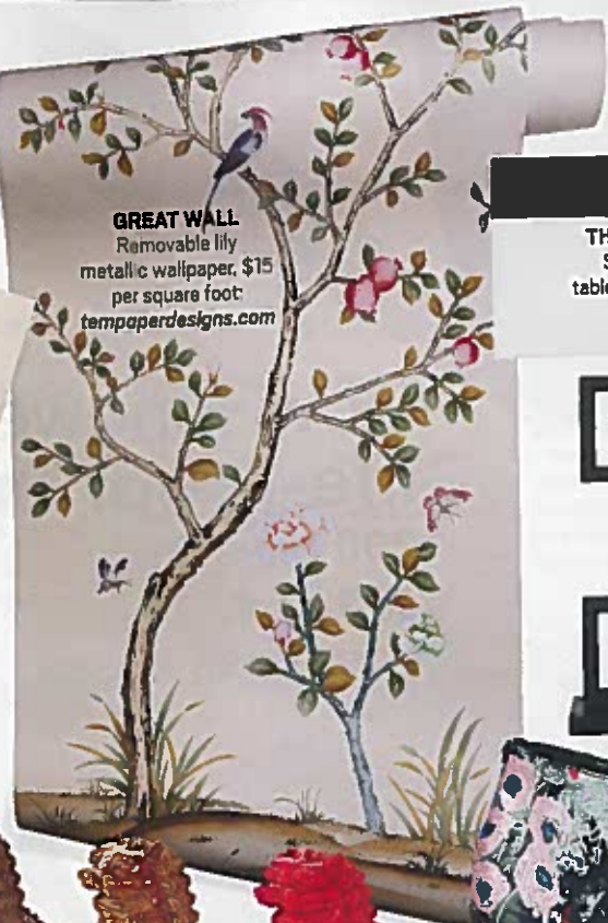
GREAT WALL Removable lily metallic wallpaper, $15 per square foot; tempaperdesigns.com