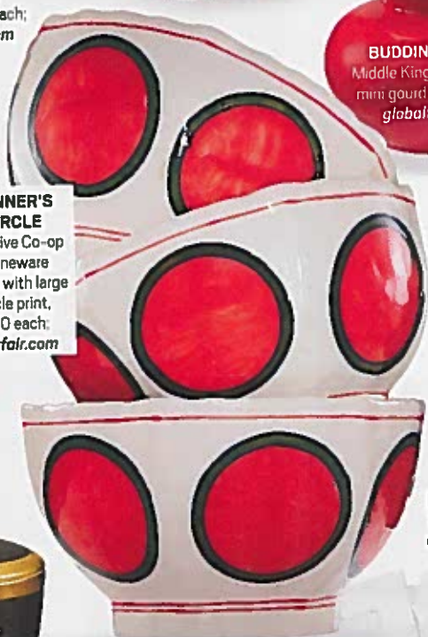
WINNER'S CIRCLE Creative Co-op stoneware bowls with large circle print, $30 each; wayfair.com