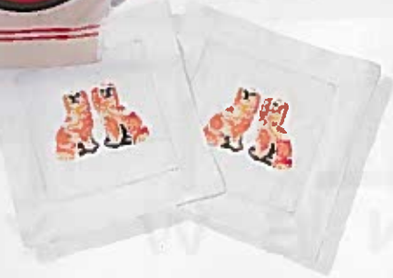
GOOD, CLEAN FUN Linen cocktail napkins, $48 for four; halohomebyksw.com