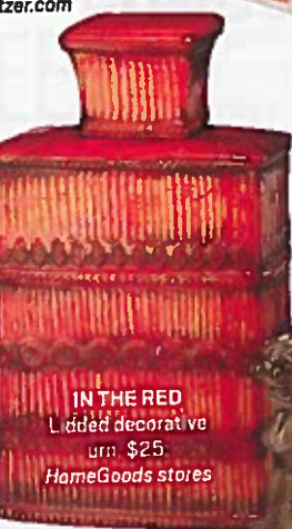
IN THE RED Lidded decorative urn, $25; HomeGoods stores

TAG, YOU'RE IT Pagoda gift tags, $8 for ten; shop.alexapultz.com