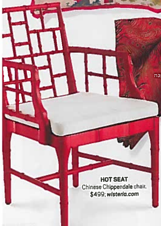
HOT SEAT Chinese Chippendale chair, $499; wisteria.com

WHY SITUATION Paradise coral 5-by-23-inch pillow, $130; naturepillows.net